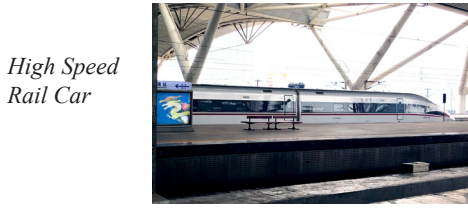
High Speed Rail Car